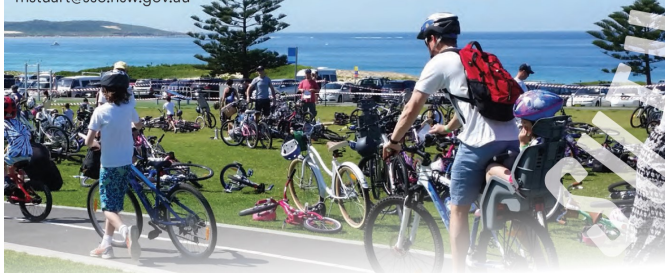
Presented by Sutherland Shire Council as part of NSW Bike Week.

Wet weather: check online, or call 9521 5690 or 9545 2345 after 9am Sat.